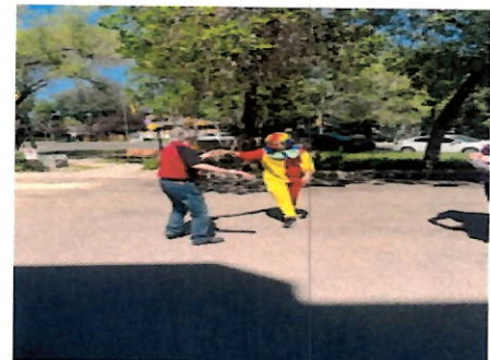
"Young at Heart" performed for us on June 14 for our 2023 Summer Social. It was a beautiful day which all of our residents and families enjoyed!