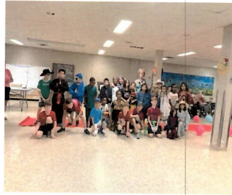
Jack Mackenzie School children entertained our residents on May 30 with a fashion show. The residents loved it!