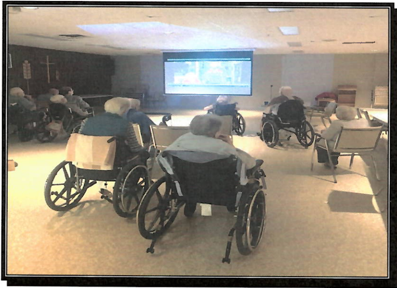
Santa Maria's First Official Movie Day in the Auditorium with our new system!