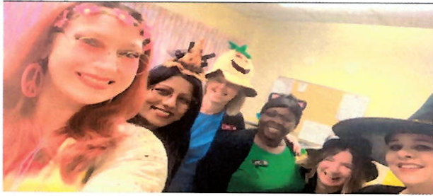
Some of the staff dressed up for Halloween!

Always, and especially in this time of world conflict, Lest We Forget